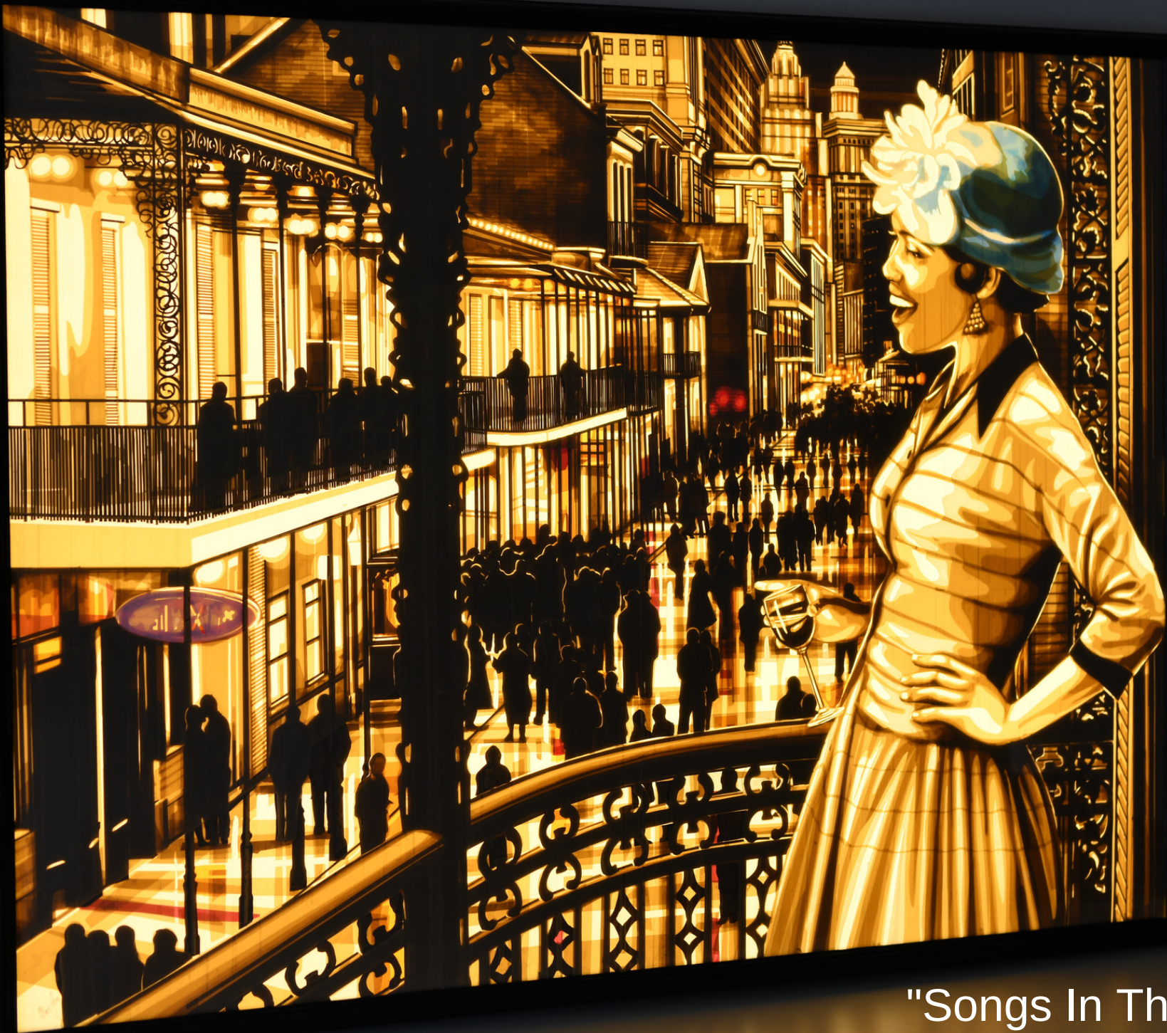
"Songs In The Air"