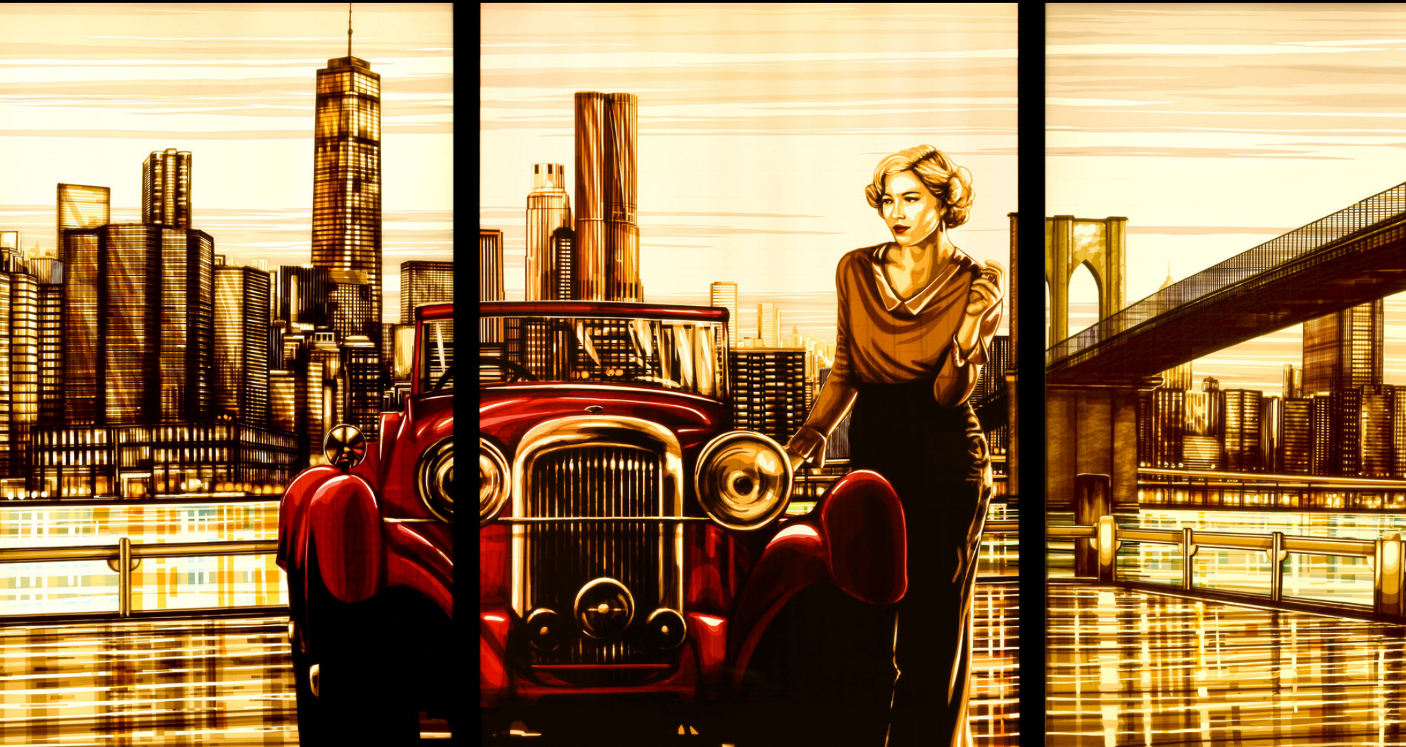
"Floating In Time" by Max Zorn